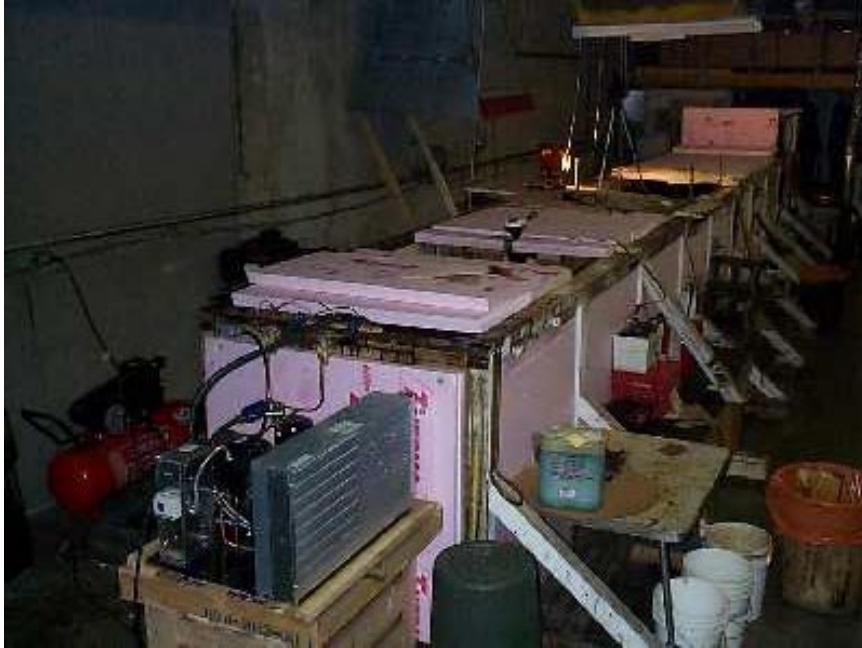
Figure 1 Test Tank with Insulation and Refrigeration Unit

The test set-up is as follows. Surface oil is held in a 1.0 m by 0.75 m rectangular area in the middle of the tank using an air bubble curtain barrier. Surface oil remains within this confinement zone in the presence of the 15-cm amplitude, 1.5-second period waves used in the tests.